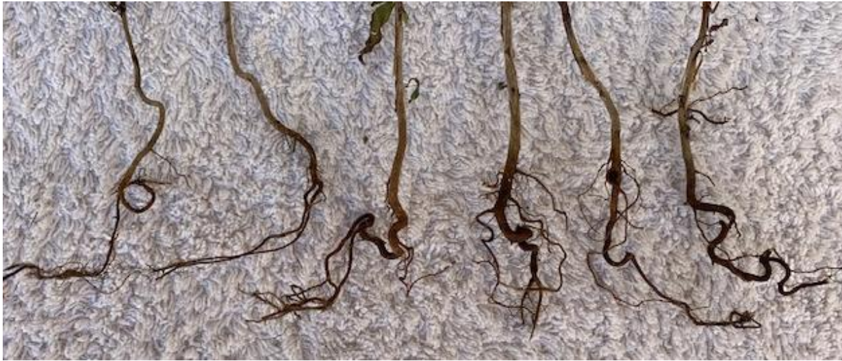
Set 4 - Showing two J-rooted trees, three J-rooted and kinked, and one straight-rooted tree

classifications – in plain English, there is significant variation between the six suppliers that is highly unlikely to be a random result.