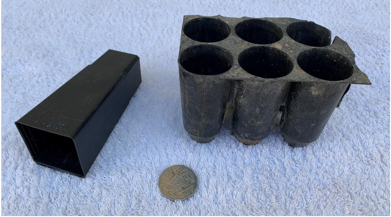
Forestry tube pot and six Hiko pots cut from a larger Hiko tray of 40 pots

It is important to flag here that even perfectly rooted tube stock trees face problems if they are left in their tubes for too long and their roots are allowed to become pot bound. This is a strong argument for planting out tube stock trees in autumn rather than in spring, in addition to the other benefits of the trees getting their roots established over winter into the surrounding soil so that they are well placed to handle a dry spring or summer (see HCLG YouTube video 'Why We Should Plant Paddock Trees in Early-Autumn' https://youtu.be/-986Pve8aLo ).