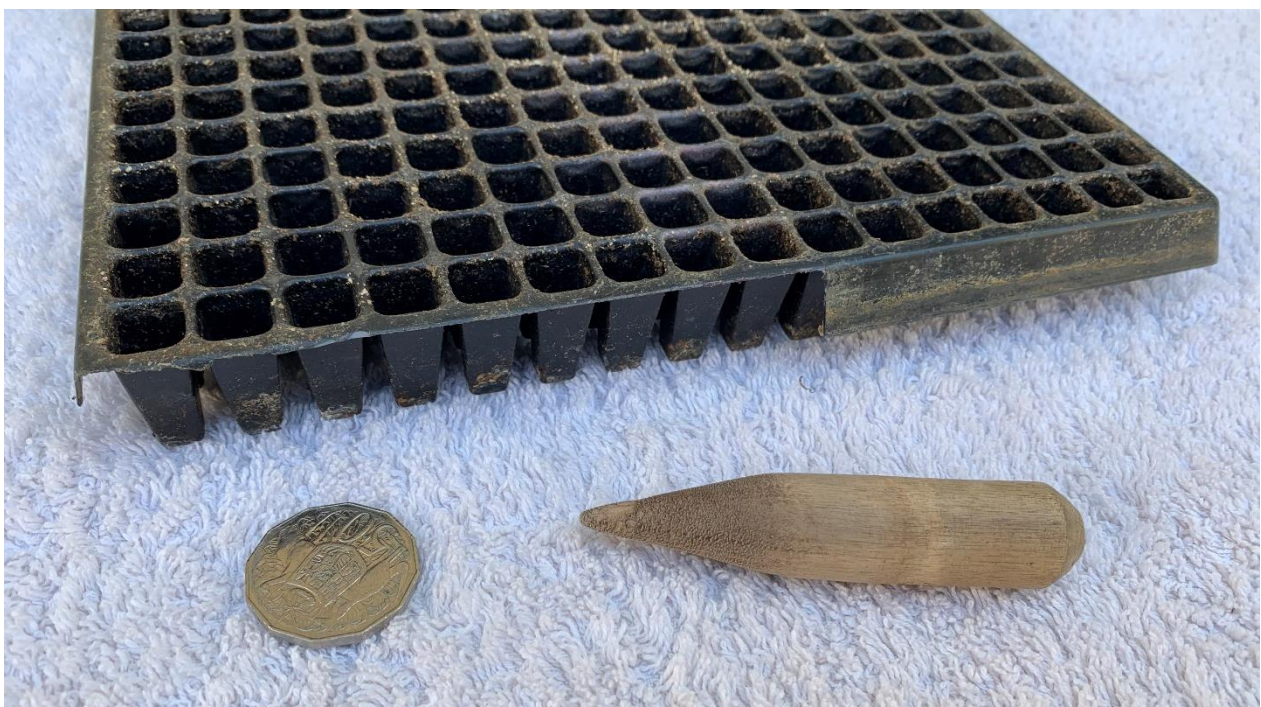
Part of plug tray with wooden dibber used to insert soil plug with seedling into forestry tube pots

The average sale price for the trees in the survey was $3.00 each. However, based on Hovells Creek Landcare Group's NSW ET-funded paddock tree project, the total materials cost per paddock tree