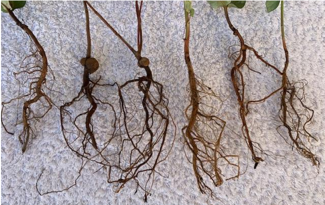
Set 5 - Showing six straight-rooted trees (though one is slightly kinked)

between the taproot and the above ground parts of the tree, but also weakens the capacity of the taproot to anchor the tree into the ground.